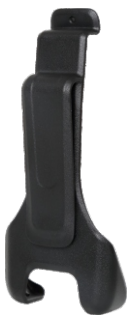
PD355 Belt Clip