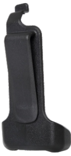
PD365 Belt Clip