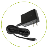
Micro USB Power Adapter (5V/1A)